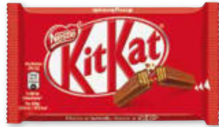
KitKat Article 1195 41,5 g