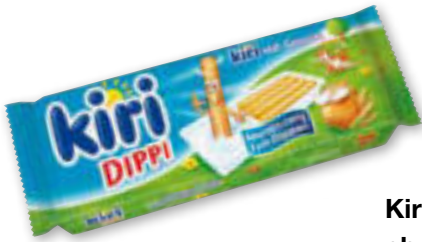
Kiri Dippi® cheese snack with breadsticks Article 4001, 35 g