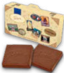
FEODORA "Mini-Suitcase" (2 filled chocolate bars) Article 1154, 24 g