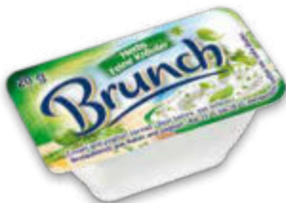
Spread of Cream and Joghurt “Brunch” Article 4006, 20 g

In particular our large variety of cheese portions offer optimal solutions for any kind of airline purposes (breakfast, lunch, dinner and snack).