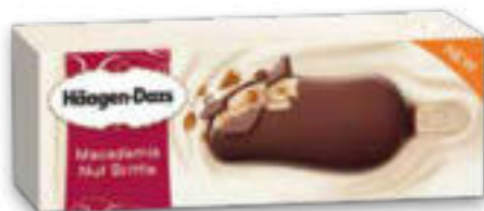
Häagen-Dazs Stick Bar “Macadamia Nut Brittle” Article 5005, 80 ml