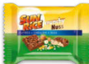
Crunchy snack nuts Article 1231, 14 g