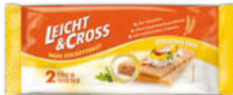
LEICHT&CROSS Crispbread (2 pcs in snack pack) Article 1028, 12 g