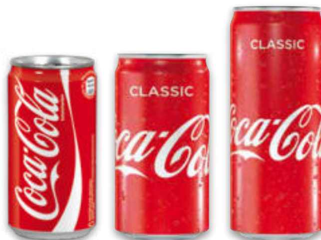
Coca-Cola OW can Article 7060, 0,25 l and 0,15 l and 0,33 l