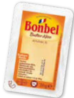
Bonbel® butter cheese Article 4004, 30 g