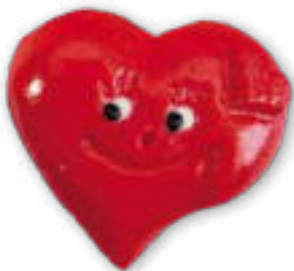
Smiling heart individually packed in shrinkfilm