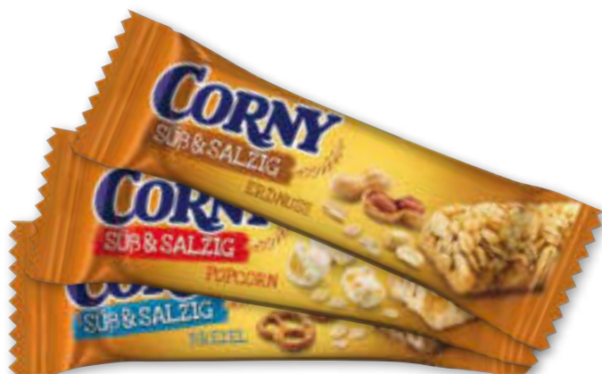
Corny Sweet & Salty 100er Peanut Article 1094, 25 g also available in different varieties