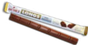
HACHEZ Longs (35 % cocoa) Article 1157, 37 g