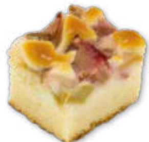
Rhubarb Cake Article 3027, 80 g