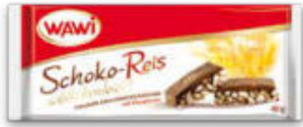
WAWI Chocolate-Rice Article 1217, 40 g