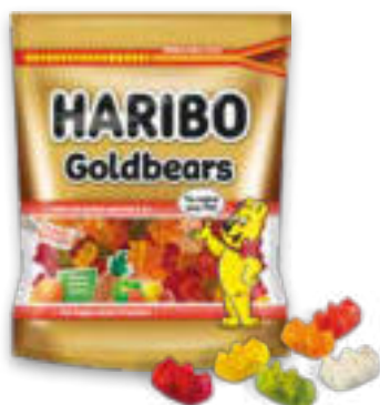
Goldbears Pouch Article 1263, 250 g