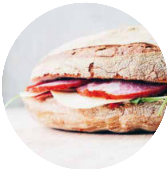
Bread/Cakes/Hot Snacks Page 46-52