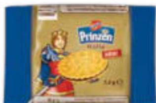
Prinzen Rolle Minis Single Pack Article 1031, 7,5 g