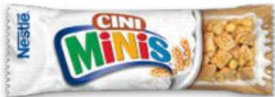
Cini Minis Cereal bar Article 1204, 25 g