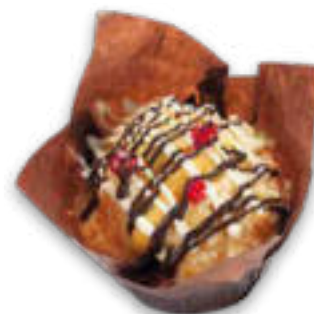
Muffin Vanilla Wildberry