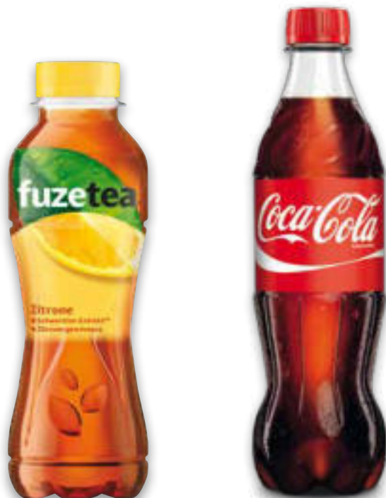
Fuze Lemon OW PET Article 7058, 0,4 l

Fuze iced tea offers a refreshing fusion of both fruity taste and the benefits of tea.