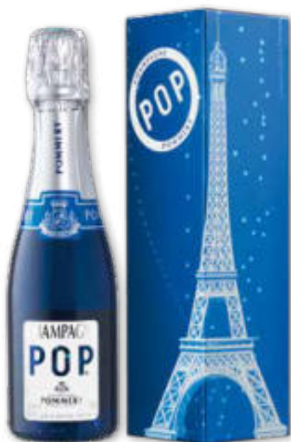
POP “La Tour Eiffel” Gift Box Article 7012, 0,2 l