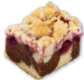
Marble Cherry Cake Article 3020, 80 g