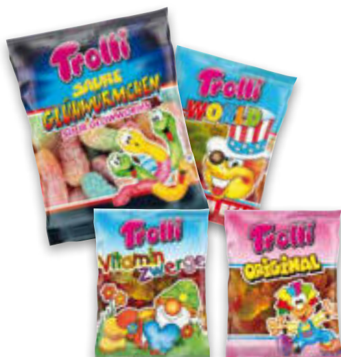
Trolli Sour Glowworms Article 1266, 10 g also available in different varieties