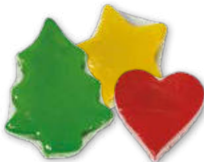
Christmas-Motives individually packed in shrinkfilm