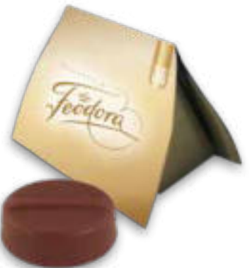
FEODORA Mini-Box with 1 Praliné, without alcohol Article 1155, 11 g