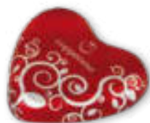
Chocolate Heart Article 1124, 20 g also available in different varieties