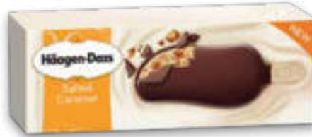
Häagen-Dazs Stick Bar “Salted Caramel” Article 5006, 80 ml