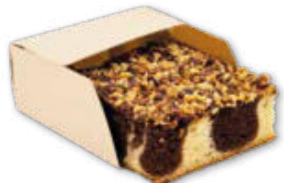
Marble Nut Article 3026, 65 g