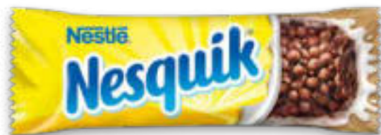
Nesquik Cereal bar Article 1205, 25 g