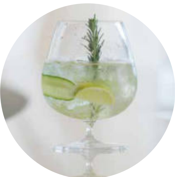
Drinks Page 65-77