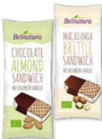
Bio Macadamia Brittle Sandwich Article 5011, 110 ml