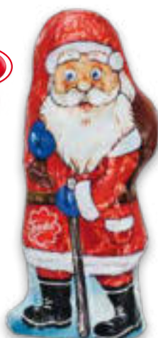
Solid figurine "Santa Claus" Article 1232, 12,5 g