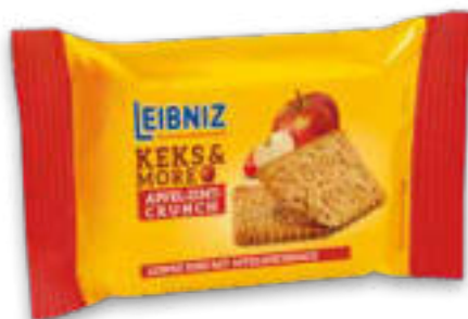
Leibniz “Keks & More Apple Cinnamon Crunch”