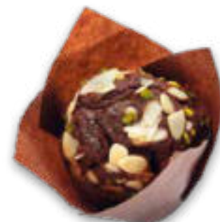
Muffin Chocolate Nuts