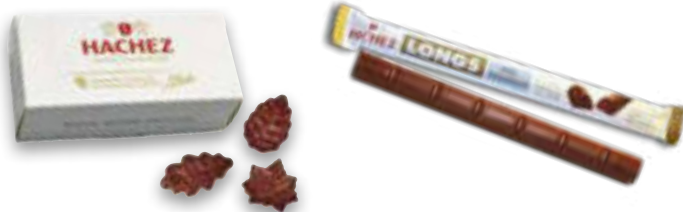
HACHEZ Minibox with "Brown Leafs", indiv. printing Article 1156, 20 g