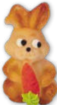
Easterbunny individually packed in shrinkfilm