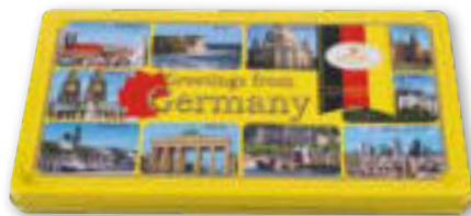
Fancy Box (different German cities)