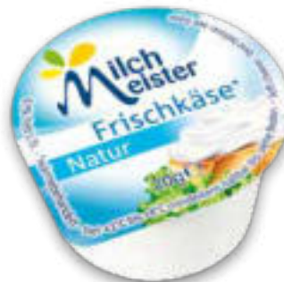
Cream Cheese “ MilchMeister ” Article 4005, 20 g

OUR SAVORS ARE GLOBE TROTTERS – consumers products developed with an intimate knowledge of local tastes and habits and a wealth of cheese-manufacturing know-how. As a branded cheese specialist and No. 1 worldwide for cheese specialties, our portfolio includes all types and formats of cheese and fulfils every expectation in terms of pleasure, variety, practicality and wellbeing.