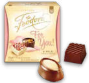
FEODORA Pralinés "For You" Article 1153, 40 g