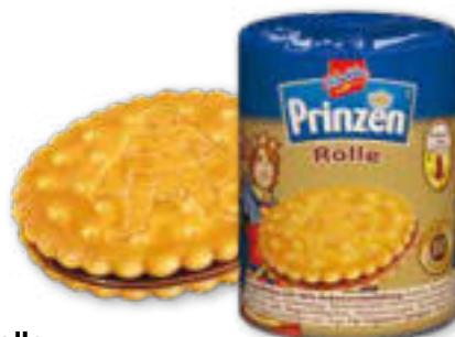
Prinzen Rolle Article 1034, 141 g