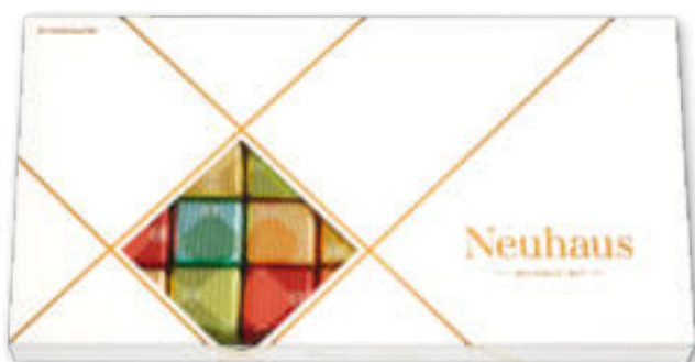
Bonbon Sharing Box (27 pcs)