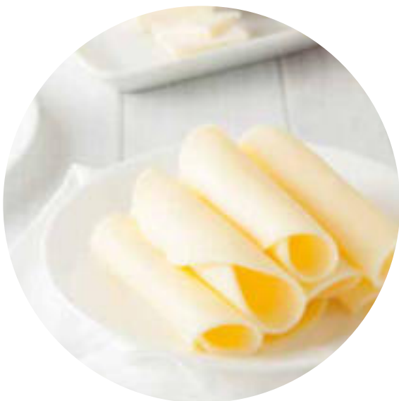
Dairy Page 53-55