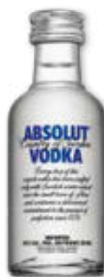
Absolut Vodka Blue 40 % PET Article 7006, 50 ml and 1 l