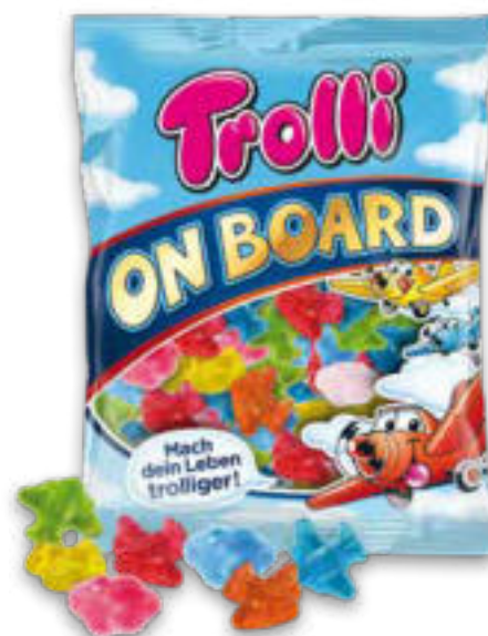
Trolli On Board Planes Article 1268, 15 g | 100 g