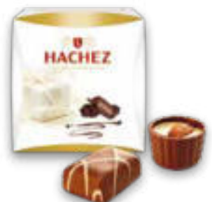
HACHEZ Box with 4 Pralinés without alcohol Article 1161, 37 g