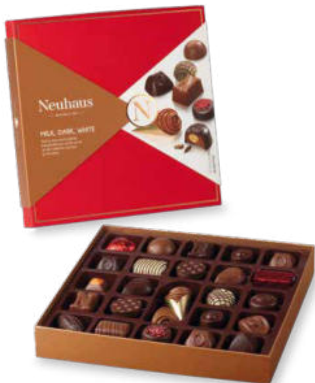
Neuhaus Collection “Milk, Dark, White” (25 pcs)