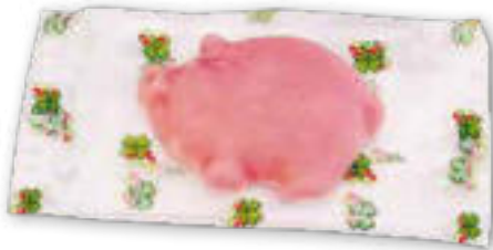
Piglet individually packed in flowbag