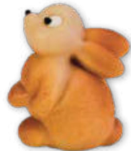
Bunny individually packed in shrinkfilm