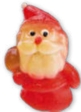
Tiny Santa individually packed in shrinkfilm