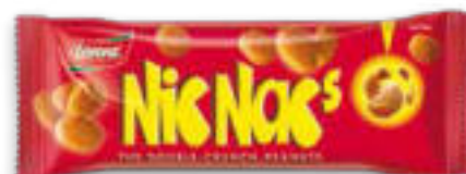
Lorenz NicNac's Article 2016, 40 g