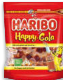
Happy Cola Pouch Article 1265, 250 g