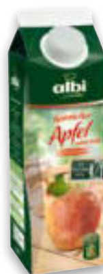
Apple Juice Unfiltered ELOPAK OW Article 7053, 1 l

This is their credo for 85 years now, in the 3rd generation of family ownership.