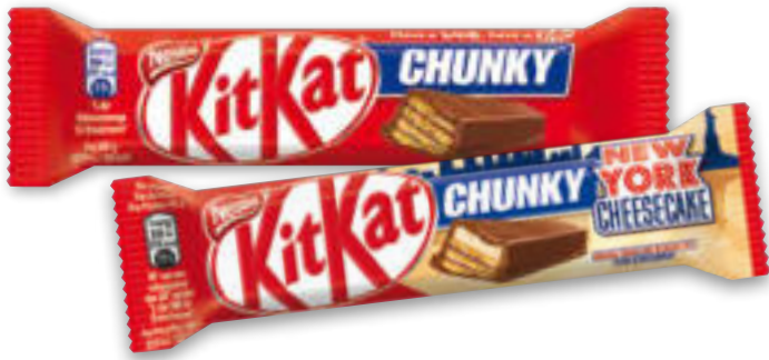
KitKat Chunky Article 1196, 40 g