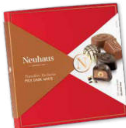
Traveller's Exclusive (12 pcs)