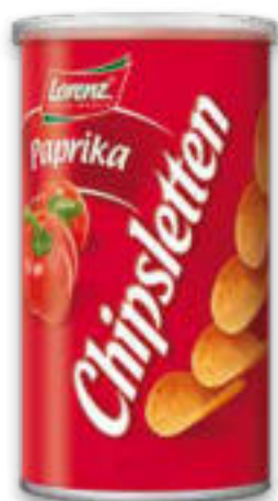
Chipsletten Paprika Article 2017, 60 g