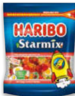
Star Mix Pouch Article 1264, 250 g