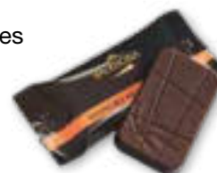
Nyangbo Mini bar with 68 % Dark Chocolate pur Ghana Article 1170, 3,3 g