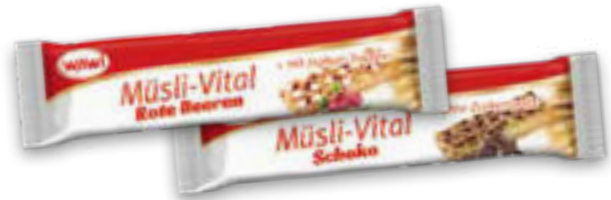
WAWI Muesli-Vital Red Berries, Chocolate Article 1221, 25 g

WAWI is a private business founded back in 1957. Today, over 60 years later, we are specialized in the production of Chocolate and Sweet delights. Our brand portfolio comprises well known names such as WAWI, NAPPO, Moritz and Mount Momami, especially our famous and beloved 'Schoko-Reis' bar. It is produced using only the highest quality ingredients, such as Chocolate containing Cocoa from Java and Sumatra, or rice from Northern Italy. Cocoa is also the key to our special WAWI Chocolate recipes. Share our excitement for quality – sit back and enjoy!