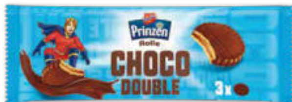
Prinzen Rolle Choco Double Article 1032, 33,75 g