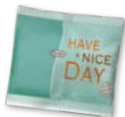
Mini bags "Have a nice day" Article 1175, à 20 g (also available as chocolate mint lentils, butter almond brittle, caramel chocolate cereal balls)