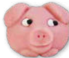
Babypig in individually packed shrinkfilm