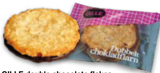
GILLE double chocolate flakes