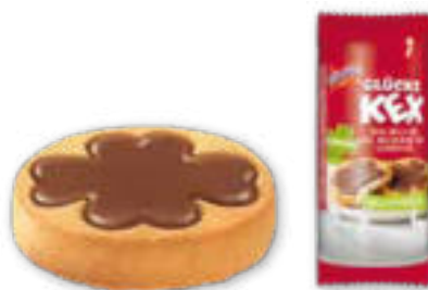
DeBeukelaer GLÜCKS-KEX Snack Pack (milk chocolate) Article 1030, 37,5 g