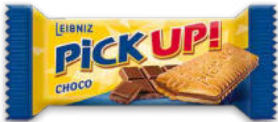
Leibniz “PiCK UP! Choco”