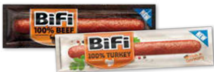
Bifi 100 % Beef Article 2013, 20 g