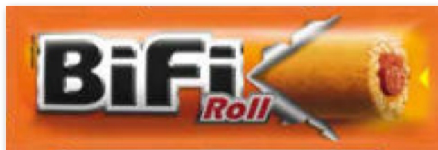
Bifi Roll Article 2010, 50 g