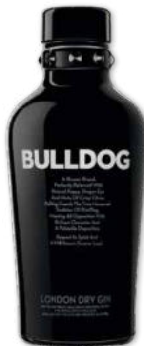
Bulldog Gin 40 % Article 7007, 1 l