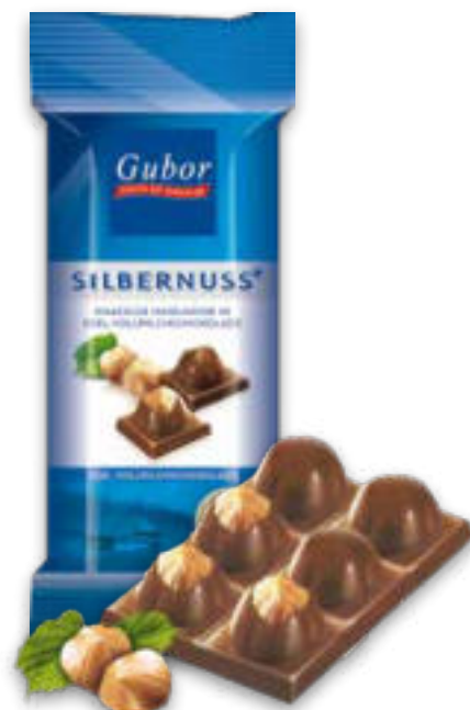
Silbernuss bar Article 1228, 25 g