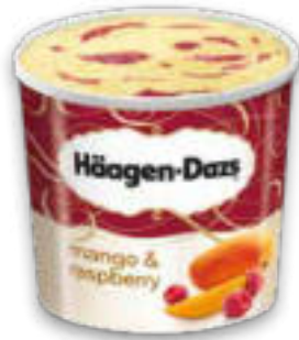
Häagen-Dazs Mango & Raspberry (incl. Spoon) Article 5003, 100 ml