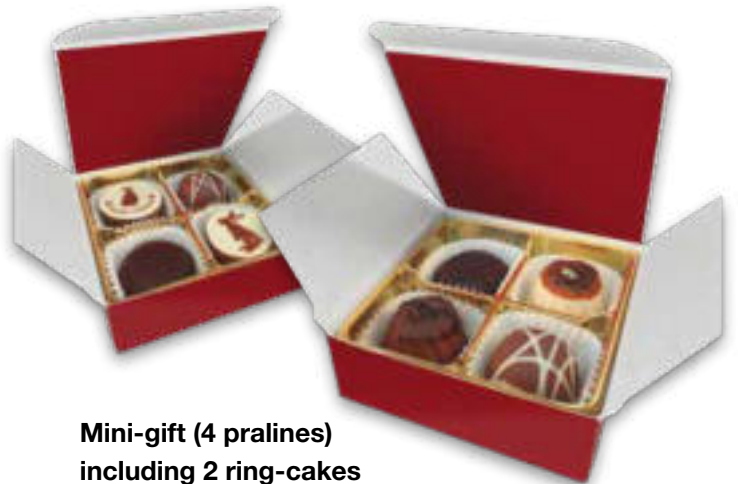
Mini-gift (4 pralines) including 2 ring-cakes

Article 1121, 54 g, also available in different varieties