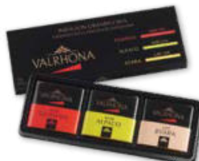
Tasting tray with 3 Chocolate Squares Article 1174, 15 g