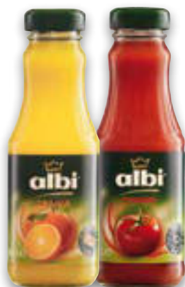
Orange Juice Bottle Tomato Juice Bottle Article 7049, 0,2 l