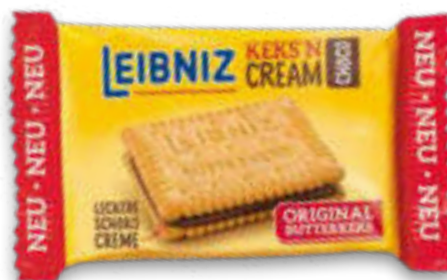
Leibniz “Keks'n Cream Choco”