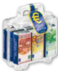
Small case "EURO"