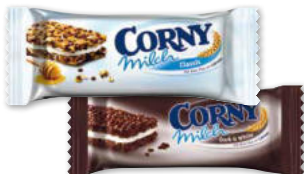
Corny Milk 100er Classic Article 1090, 30 g also available in different varieties