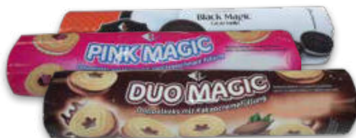
PINK MAGIC sandwich cookie with raspberry-vanilla filling