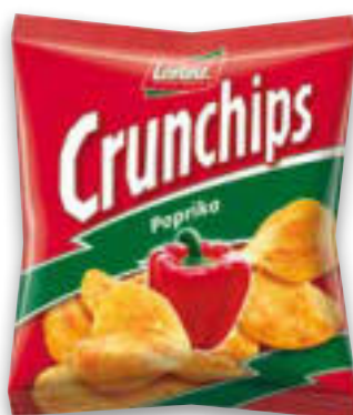
Crunchips Paprika Article 2018, 20 g