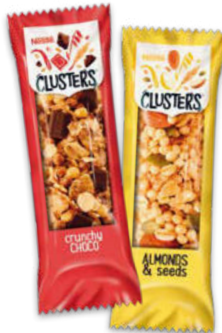
Cluster's Crunchy Choco Cereal bar Article 1206, 35 g