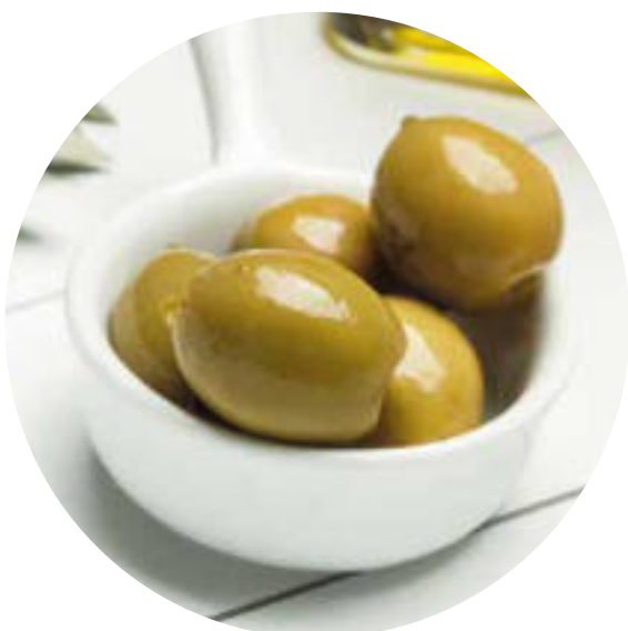
Dry Goods/Specialities Page 58-64