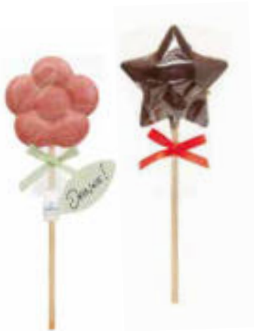
Chocolate Lolly Article 1125, 40 g also available in different varieties