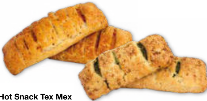
Hot Snack Tex Mex Article 3024, 100 g