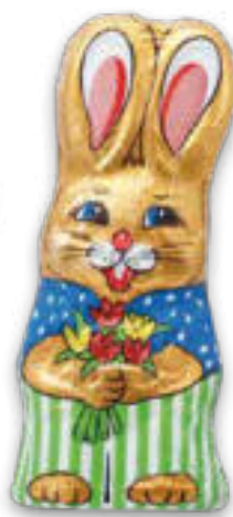
Solid figurine "Easter Bunny" Article 1233, 12,5 g