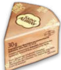
Soft Cheese “Saint Albray” Article 4008, 30 g