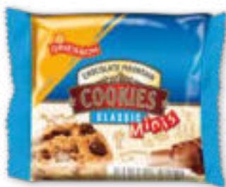
Griesson Chocolate Mountain Cookies Minis Single Pack Article 1027, 6 g