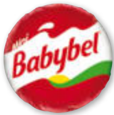
Mini Babybel® Original Article 4002, 20 g