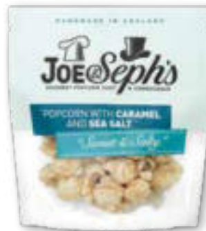
Salted Caramel Gourmet Popcorn Mini Transparent Pack Article 1223, 17 g