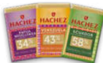
HACHEZ Minibars "single origin" Article 1160, 7,5 g