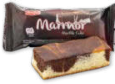
Lemon Cake Bar Article 3022, 40 g