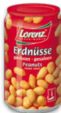
Peanuts roasted + salted (conv. Can) Article 2019, 200 g