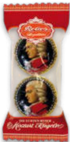
“MOZART Kugel” (2 pcs flowpack) Article 1163, 40 g