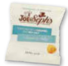
Salted Caramel Gourmet Popcorn Foil Pack Article 1224, 7 g

Coconut & Chia Gourmet Popcorn Foil Pack Fairtrade Salted Caramel Gourmet Popcorn Foil Pack Article 1225, 18 g