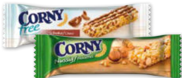
Corny 100er Nut Article 1088, 25 g also available in different varieties