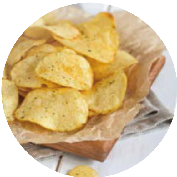
Salty Page 42-45