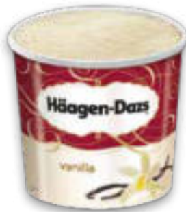
Häagen-Dazs Vanilla (incl. Spoon) Article 5002, 100 ml