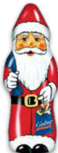
Hollow figurine "Santa Claus" Article 1227, 20 g