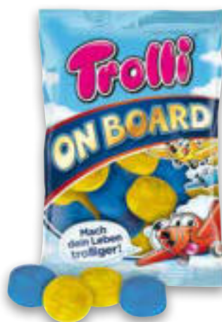
Trolli On Board Airline Branded Article 1267, 15 g