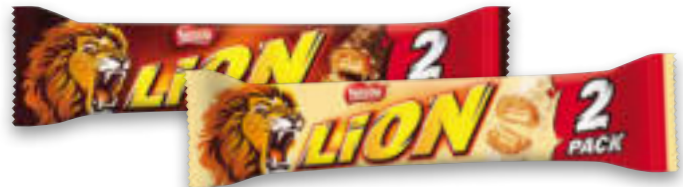
Lion 2 Pack Article 1202, 2 x 30 g