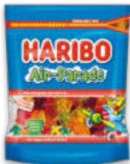
Air-Parade Pouch Article 1262, 250 g

Article 1261, 10 g | 12 g also available in different varieties