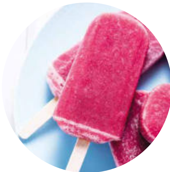
Frozen Page 56-57