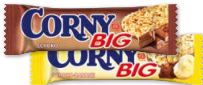
Corny Big Chocolate Article 1091, 50 g also available in different varieties