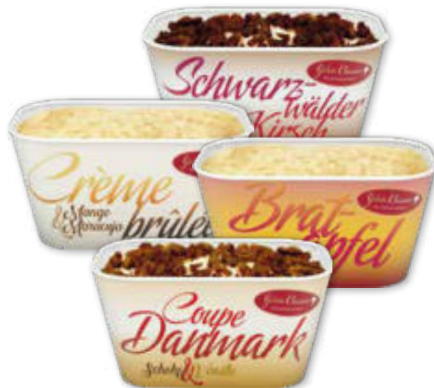
Coupe Danmark Chocolate Vanilla Article 5010, 135 ml