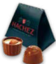
HACHEZ Minibox with 2 Pralinés, indiv. printing Article 1158, 21 g