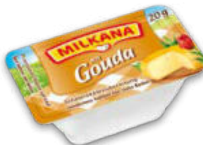
Processed Cheese “Milkana” Article 4007, 20 g