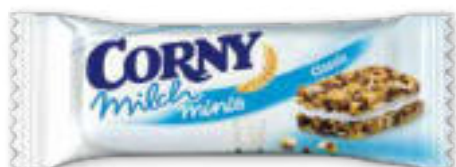
Corny Mini 144er Milk Classic Article 1092, 19 g