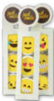
"Just Smile" SmartPack (3 pcs) Article 1146, 8 g