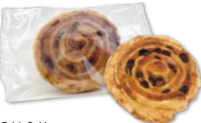
Raisin Swirl Article 3028, 65 g