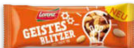
Geistesblitzer Nuts & Fruits Article 2015, 40 g