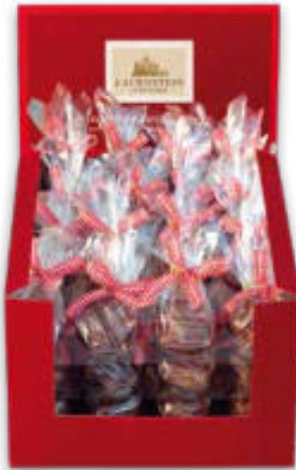
Christmas pralines (star or christmas tree) filled with marzipan in milk or dark chocolate; wrapped in cello, Article 1122, 13 g