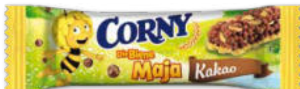
Corny Maya the Bee 100er Article 1093, 23 g