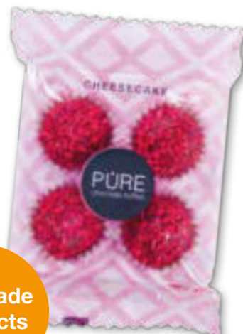
Raspberry-Cheesecake truffles and vaffle decor (4 pcs) Article 1168, 32 g

We think of an each truffle as a mini celebration – the perfect accent to any moment. CELEBRATE ANY MOMENT