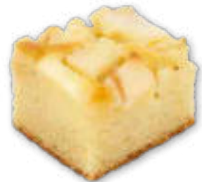
Apple Cake Article 3023, 80 g