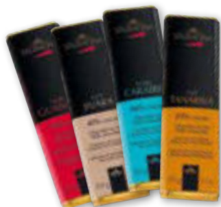
Chocolate mini-bars (Guanaja 70 %, Caraïbe 66 %, Jivara 40 %, Tanariva 33 %) Article 1171, 20 g

Valrhona's story began in 1922 with passion, commitment and excellence as its guiding lights. Alongside our partners and customers, we imagine the best of chocolate every day at each stage of the value-chain: cocoa selection and cultivation, chocolate production and transmission of flavor and expertise. Together, let's make sure all clients live a unique experience and receive the extra attention they deserve!