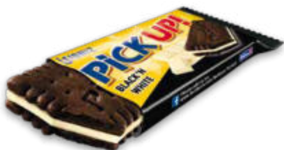
Leibniz “PiCK UP! Black'n White”