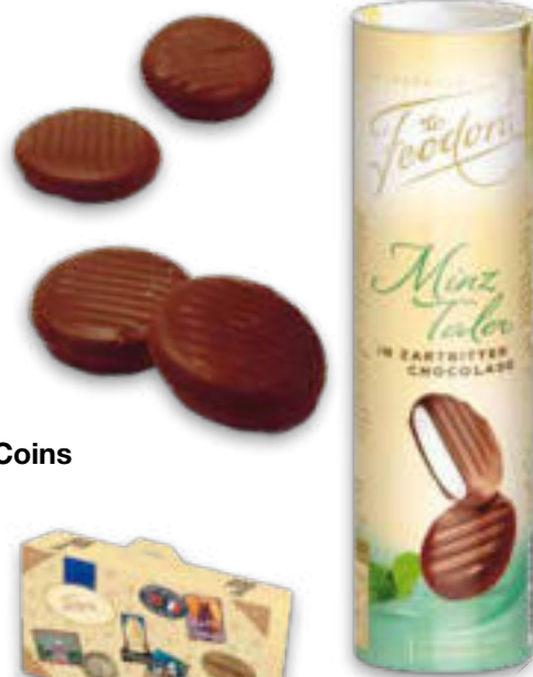
FEODORA Peppermint Cream Coins Article 1152, 100 g