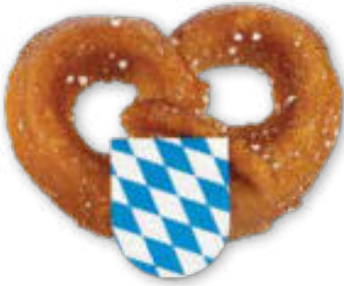
Bavarian pretzel individually packed in Clipbag