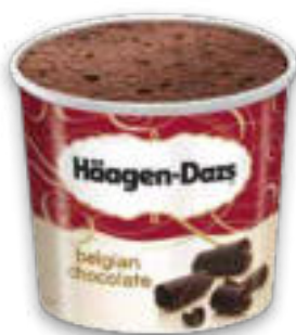
Häagen-Dazs Belgian Chocolate (incl. Spoon) Article 5001, 100 ml