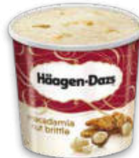
Häagen-Dazs Macadamia Nut Brittle (incl. Spoon) Article 5004, 100 ml