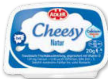
Cheesy® fresh cheese plain Article 4003, 20 g