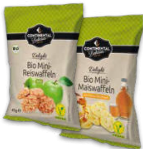
BIO Mini apple rice cake