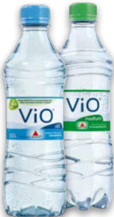
ViO Still OW PET ViO Medium OW PET Article 7057, 0,5 l