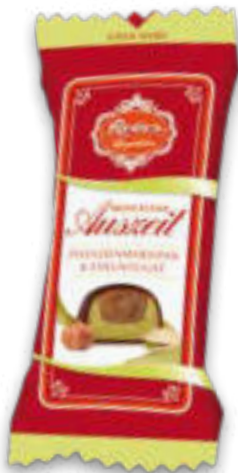
Pistachio-Marzipan “Kleine Auszeit” (2 pcs flowpack) Article 1164, 20 g