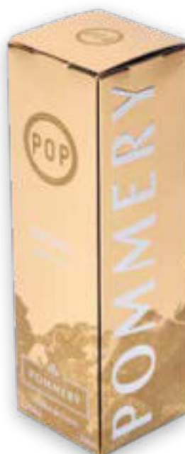
Gold POP “Vintage Grand Cru” Gift Box Article 7015, 0,2 l