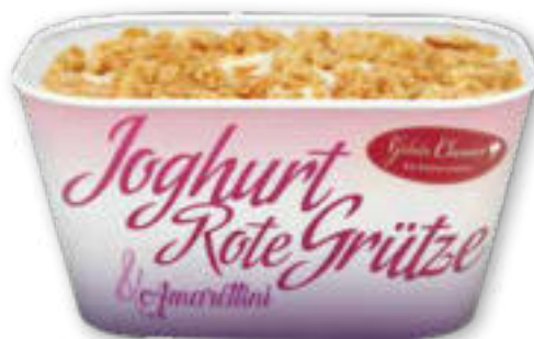
Yogurt red fruit Amarettini Article 5013, 135 ml