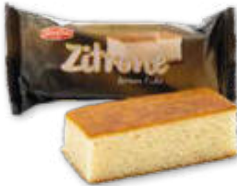
Marble Cake Bar Article 3021, 40 g

Fränkische Feinback FFB GmbH was founded in Schweinfurt, Germany. We produce ready baked and deep frozen cakes and snacks. In addition we make fresh cakes and bake-off products. Already single-packed or bulk-packed. Our goods taste like home made, enjoy!