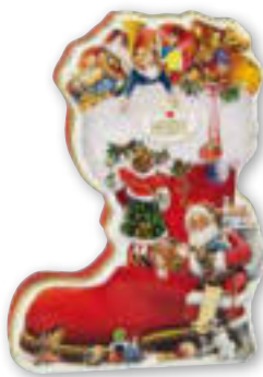
Gift Box "Christmas Boot"