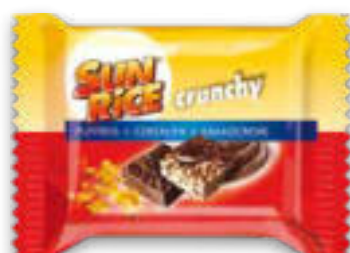
Crunchy snack cocoa cream Article 1230, 15 g