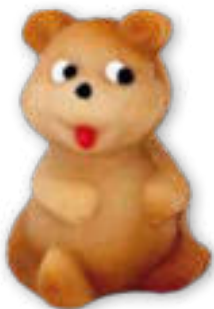
Teddybear individually packed in shrinkfilm