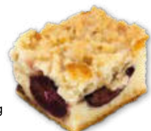
Plum Cake Article 3029, 80 g