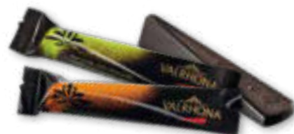
Chocolate mini-sticks Dark 61 %, dark Andoa 70 %, milk 39 % Article 1169, 4,1 g also available in different varieties