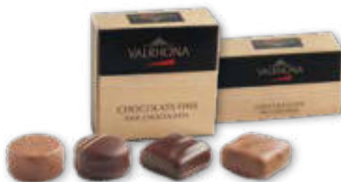
Weight for Dark & Milk Chocolate Ballotins: Article 1172, 2 pcs à 21 g Article 1173, 4 pcs à 41 g