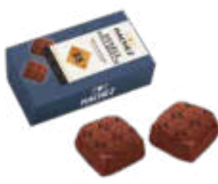
HACHEZ Minibox "A Matter of Taste" (2 Pralinés without alcohol) Article 1159, 22 g