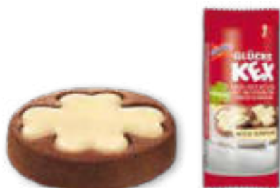
DeBeukelaer GLÜCKS-KEX Snack Pack (white chocolate) Article 1029, 37,5 g