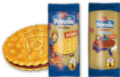
Prinzen Rolle Minis Snack Pack Prinzen Rolle Minis "Milchschatz" Snack Pack Article 1033, 37,5 g