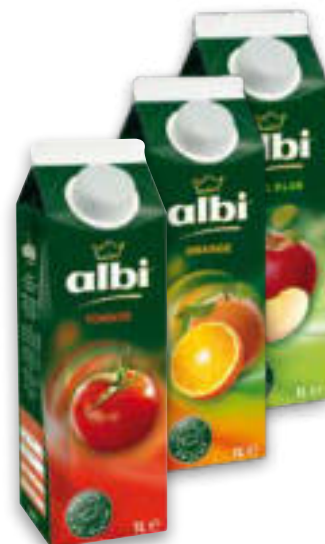
Tomato Juice ELOPAK OW Article 7050, 1 l Orange Juice ELOPAK OW Article 7051, 1 l Apple Juice ELOPAK OW Article 7052, 1 l